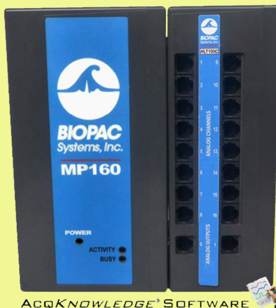
ACQKNOWLEDGE ® SOFTWARE

MP160 with AcqKnowledge 5 is the newest addition to the MP Research System line, and is functionally equivalent to the MP150 device it replaces. The MP160 and AcqKnowledge 5 combination provides a powerful tool for life science research and features enhancements including improved signal quality, an auto-sensing Ethernet port, lower power consumption, an eco-friendly design, and more. The MP160 unit ships with a HLT100C High Level Transducer module.