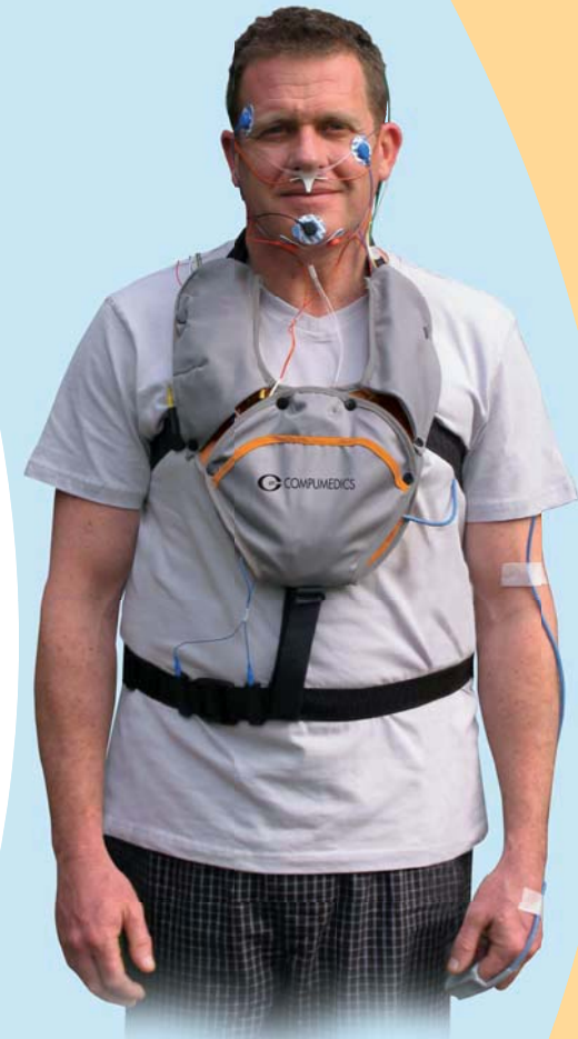
Optional EZ Vest for use with Somté PSG

Since 1987, Compumedics Limited has emerged as a world leader in the design, manufacture, and sales of diagnostic sleep, neurophysiology, research and transcranial Doppler systems. Compumedics design expertise in the area of portable physiologic recorders and wireless data transmission is just one reason for our continued growth. Compumedics is improving people's lives through innovative products, exceptional service and a full range of consumables and accessories brought to you by dedicated people who care.