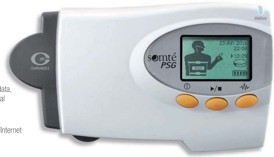
Pictured actual size