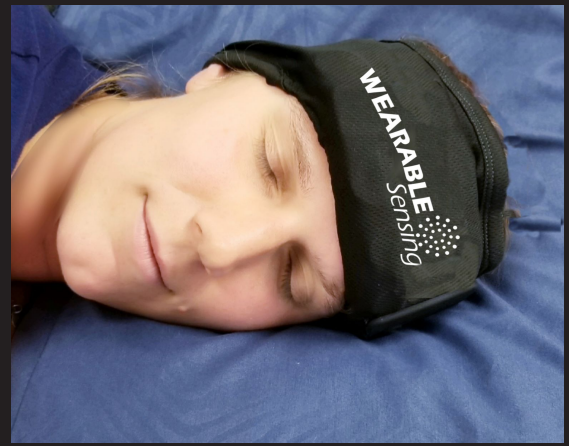
Comfortable Sleep: Wirelessly record clean EEG signals during sleep without gel, wires or movement restrictions

The system comprises ultra-high impedance active Dry Sensor Interface (DSI) sensors that require no skin preparation or conductive gels. The sensors are spring-loaded to provide constant, comfortable contact pressure that mitigates movement artifacts seen during motion and are actively and passively shielded to prevent contamination from electrical artifacts. The adjustable headband is foam padded and washable. The DSI-4 is intended for unobtrusive use during daily ambulatory activities or sleep.